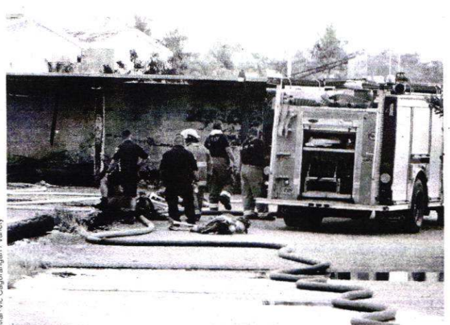
Mar. 13, 2015, Guam.

The cause of the fire is still being investigated.