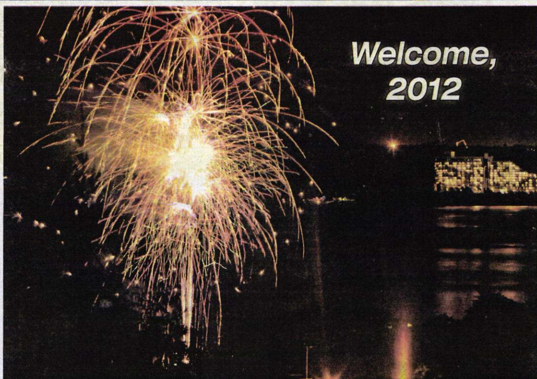
Fireworks light up the sky above Tumon as part of the annual New Year's fireworks display held this year near Gov. Joseph Flores Memorial Beach Park.