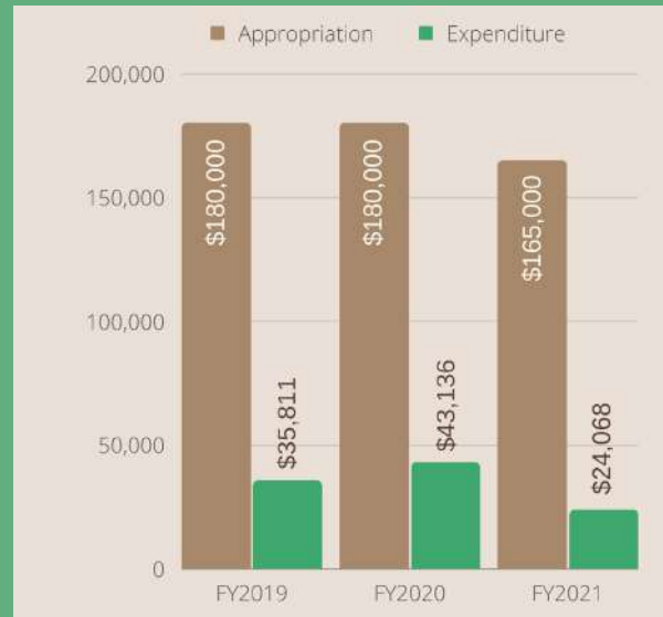
TASK FORCES FY19 - FY21